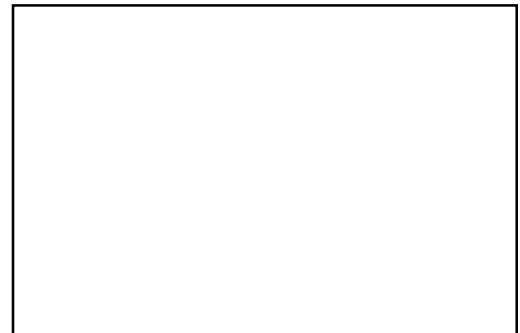
Figure 1 Mounting the Six Shooter.

The Six Shooter conveniently mounts beneath the Pro Mag Timing Control so it doesn't take up any valuable space (Figure 1). Use the four longer screws that are supplied.